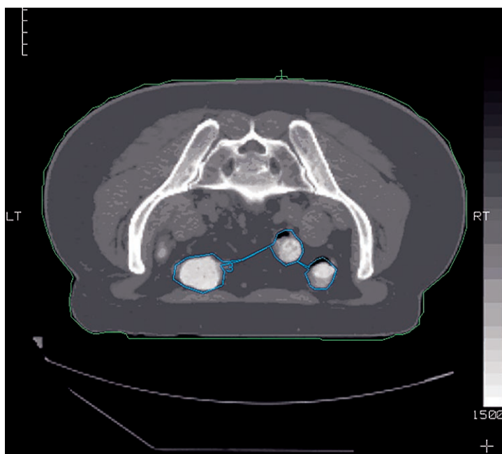
Fig. 1. CT cut view showing small intestinal loops with contrast contoured on the treatment planning system.

Both opaque and non-opaque small bowel loops were contoured for each CT slice (Fig. 1).